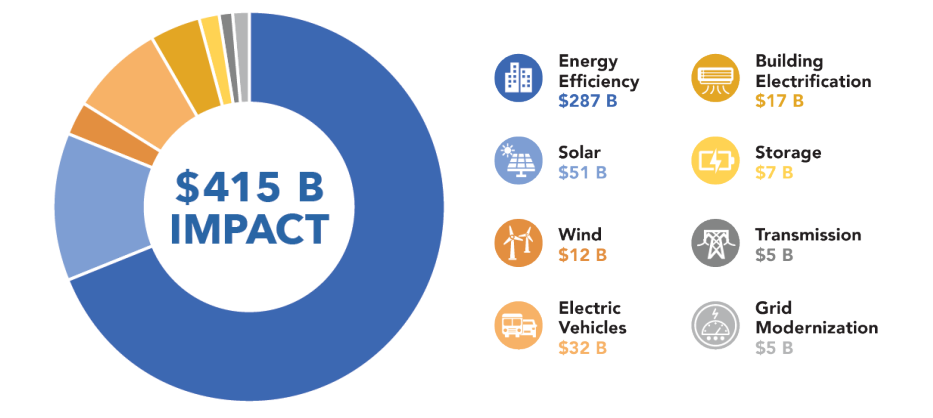
Figure 1. Total Impact of $50 Billion Stimulus Investment on the Pennsylvania Economy (GSP), by Technology

Energy efficiency investments give the greatest overall boost to the Pennsylvania economy, totaling $287 billion in GSP. The next biggest impact comes from renewable energy generation (solar and wind), totaling $62 billion, followed by electrification of transportation, with $32 billion in economic activity. Building electrification contributes $17 billion and transmission and grid modernization combine for $10.7 billion. Energy storage investments add $6.7 billion in GSP. (See Figure 1.)